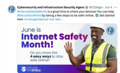
Repost Secure Our World content or reference it in your own relevant posts.