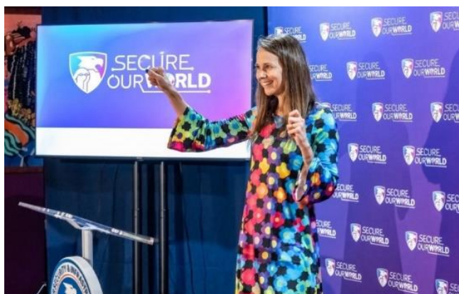
CISA Director Jen Easterly at the Secure Our World launch.

Your events have cachet across the industry. Invite CISA leadership or other speakers to talk about Secure Our World through keynotes, panels or fireside chats with your leadership during your national or regional gathering to show partnership in action. We can discuss our efforts to combat cyberattacks and reduce risk through the program. We can also promote safe online behaviors when using connected devices and amplify the importance of the partnership in promoting that message.