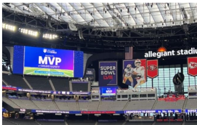
Secure Our World collaborates with Super Bowl LVIII.