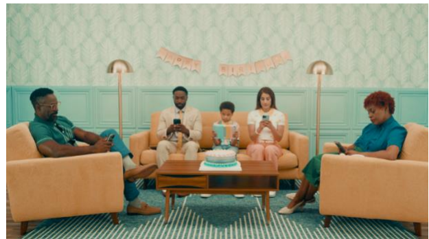
Secure Our World PSAs include live action and animated versions, in English and Spanish.

View our public service announcement videos, educational resources and toolkit at cisa.gov/SecureOurWorld . Most importantly... join us in this critical effort to Secure Our World .