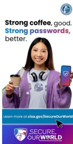
Web banner ad

Don't forget to issue a public announcement that these resources are now available!